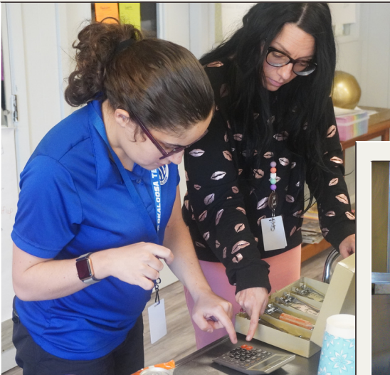
Learning how to operate a business at Okaloosa Technical College.

Take a look at the amazing work students are doing in their programs!