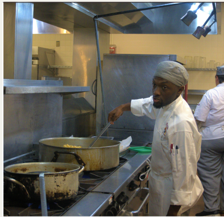
Preparing a dish at Robert Morgan Educational Center and Technical College