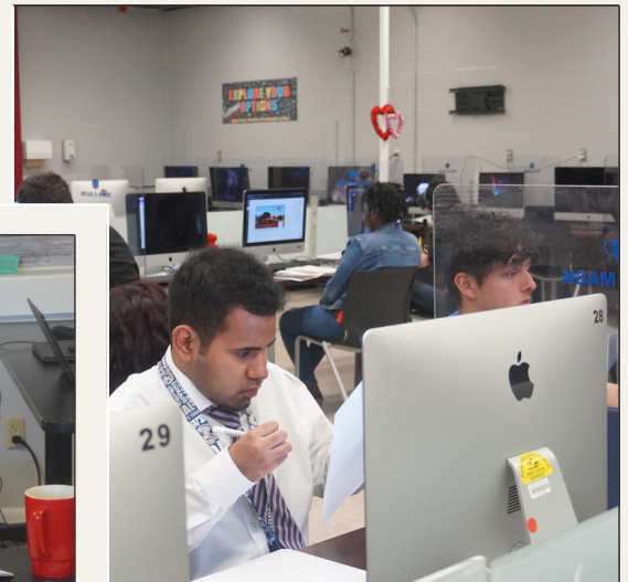
Working on a class assignment at Robert Morgan Educational Center and Technical College