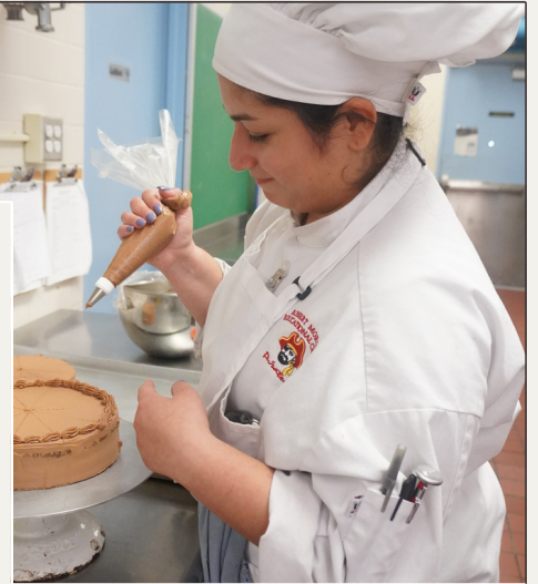
Putting the final touches on a cake at Robert Morgan Educational Center and Technical College