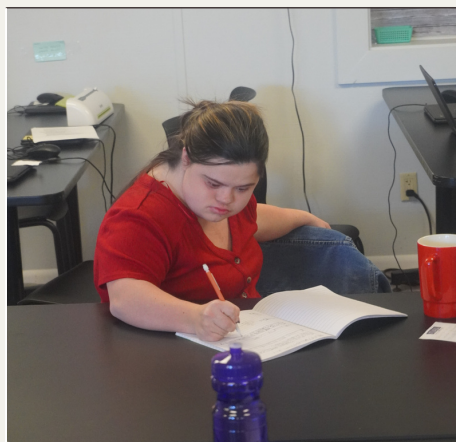
Taking notes in class at Okaloosa Technical College.